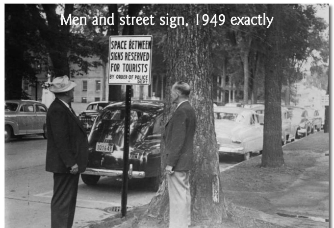
This image shows two men looking at a street sign. The sign says, "Space between signs reserved for tourists, by order of the police dept." There are several cars parked on the street which is lined by trees and a sidewalk. This is summer.