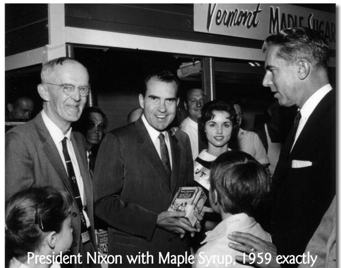
This image shows Nixon on a visit to Vermont holding a tin of "State of Vermont Pure Maple Syrup." There are several people gathered around Nixon. There is a banner in the upper right corner of the photograph that reads, "Vermont Maple Sugar."

http://www.uvm.edu/perkins/landscape/LS_View.php?FileName=LS06903