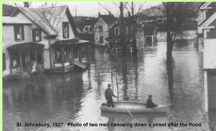
St. Johnsbury, 1927. Photo of two men canoeing down a street after the flood.

This project demonstrates remarkable changes that have taken place since the 1927 flood throughout the state of Vermont. Re-photography of historic images allows us to document this landscape change.