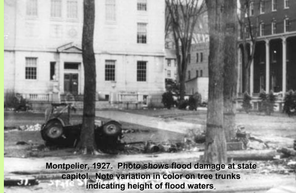
Montpelier, 1927. Photo shows flood damage at state capitol. Note variation in color on tree trunks indicating height of flood waters.