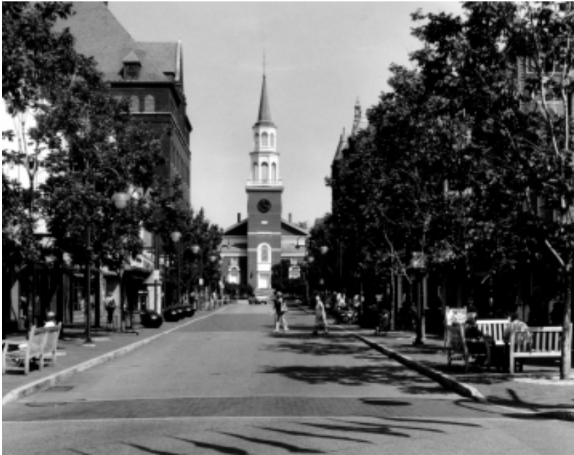
Church Street Marketplace, 1970–1980. Burlington, Vermont (LS07953).