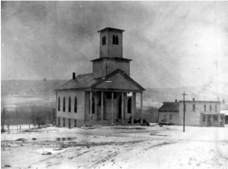
Church and Store, Village Center, 1870–1900. Tinmouth, Vermont (LS01948).