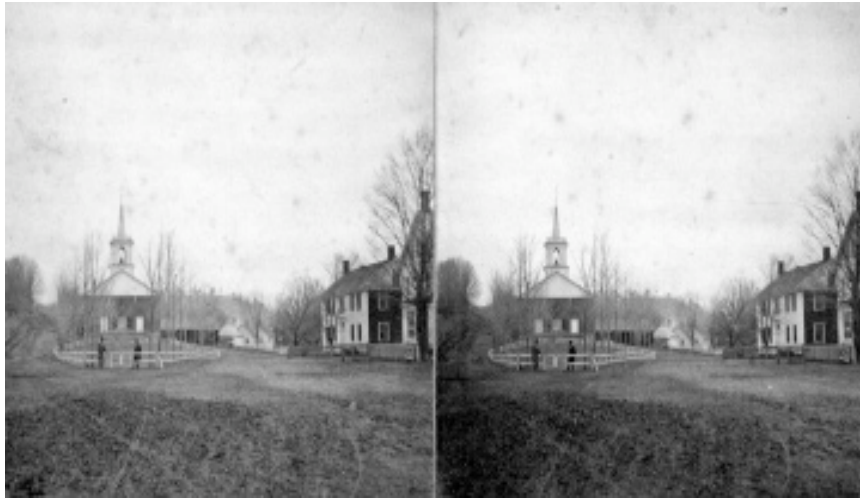
Church and Park in Perkinsville, 1860–1890. Weathersfield, Vermont (LS04916).