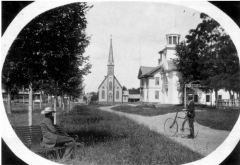
Biking on the Town Green, 1885–1900. Bristol, Vermont (LS07549).