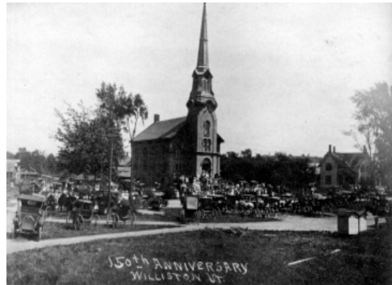
150 th Anniversary, 1913. Federated Church, Williston, Vermont (LS09869).