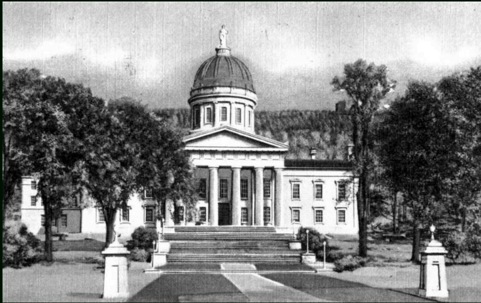
THE STATE HOUSE ( 1925 ABOUT ) LS00836_000