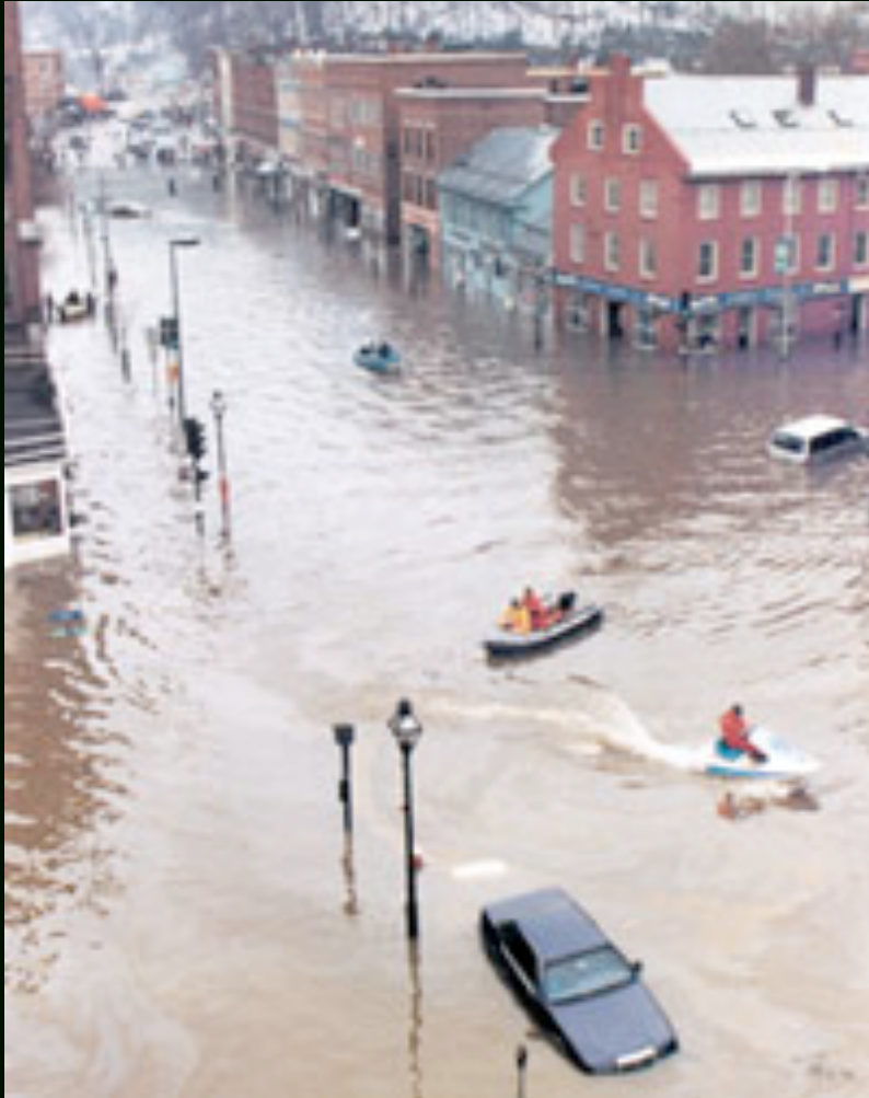
MAIN ST. DURING THE FLOOD OF 1992