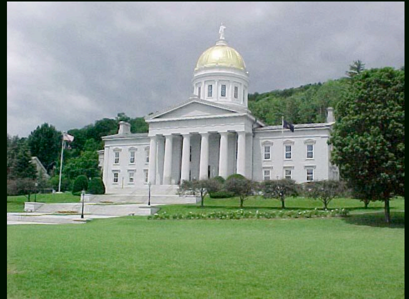
THE STATE HOUSE ( 7 / 10 / 2000 ) LS00342_001

A PHOTOGRAPHIC HISTORY OF MAJOR EVENTS FOR THE STATEHOUSE, MONTPELIER, AND VERMONT