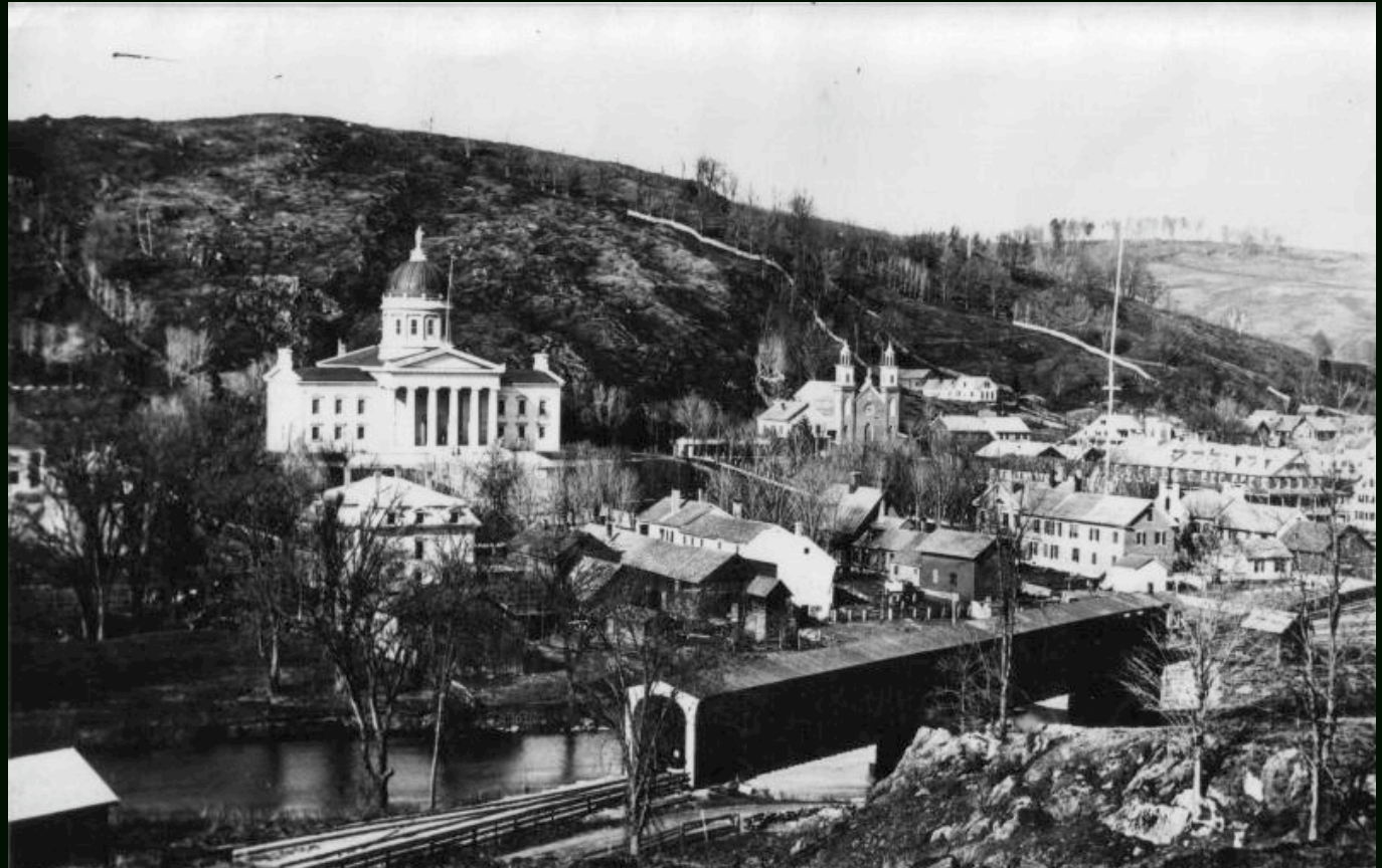
BARE HILL BEHIND THE STATEHOUSE ( 1900 BEFORE )

IN FRENCH, THE WORD "MONTPELIER", CAN BE TRANSLATED AS "BARE HILL"