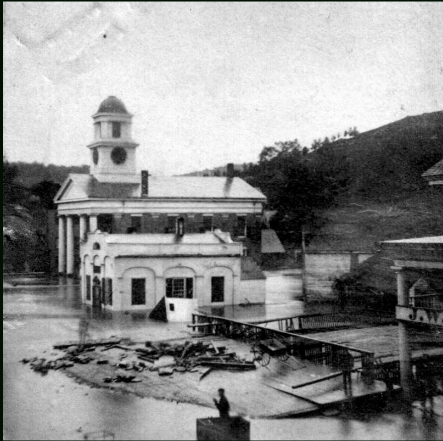
FLOODED COURTHOUSE AND BANK ( 1869-10-04 EXACTLY ) LS03906_000