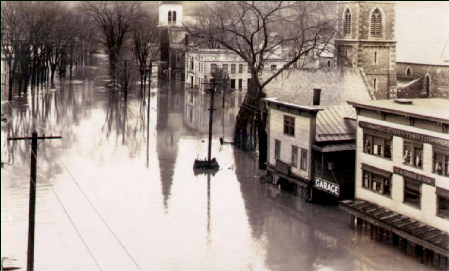
MAIN STREET FLOODED IN 1927 ( 1927 (Nov. 3-4) LS00603_000