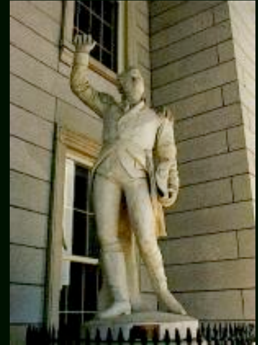
ON THE FRONT PORTICO STANDS A STATUE OF ETHAN ALLEN LEADER OF THE GREEN MOUNTAIN BOYS

ETHAN ALLEN'S BROTHER, IRA ALLEN WROTE OF VERMONT'S INHABITANTS: "THEY ARE ALL FARMERS..."