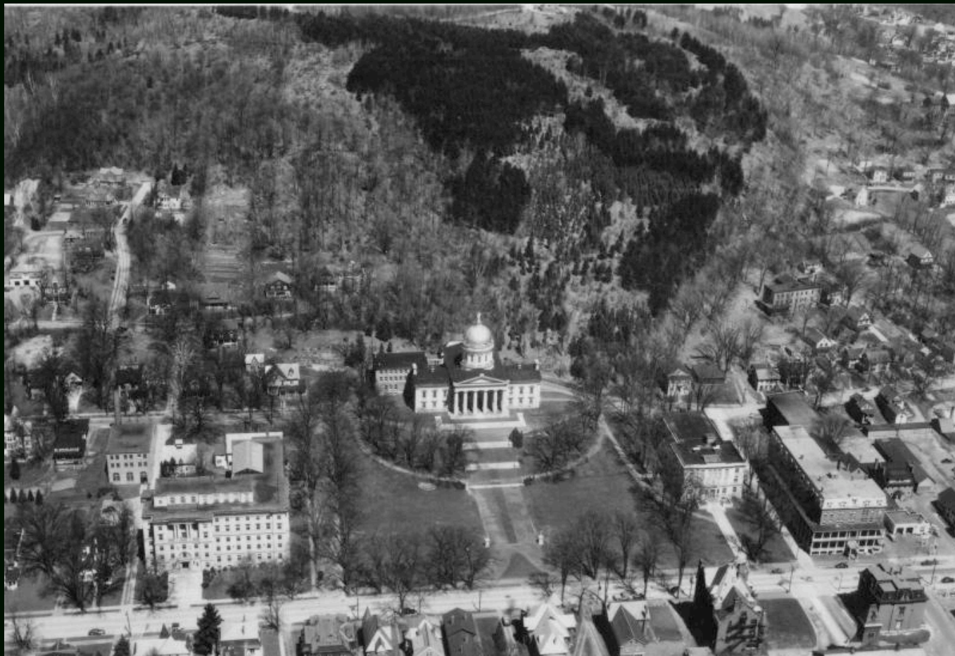
AERIAL VIEW OF STATE CAPITOL ( 1955 EXACTLY )