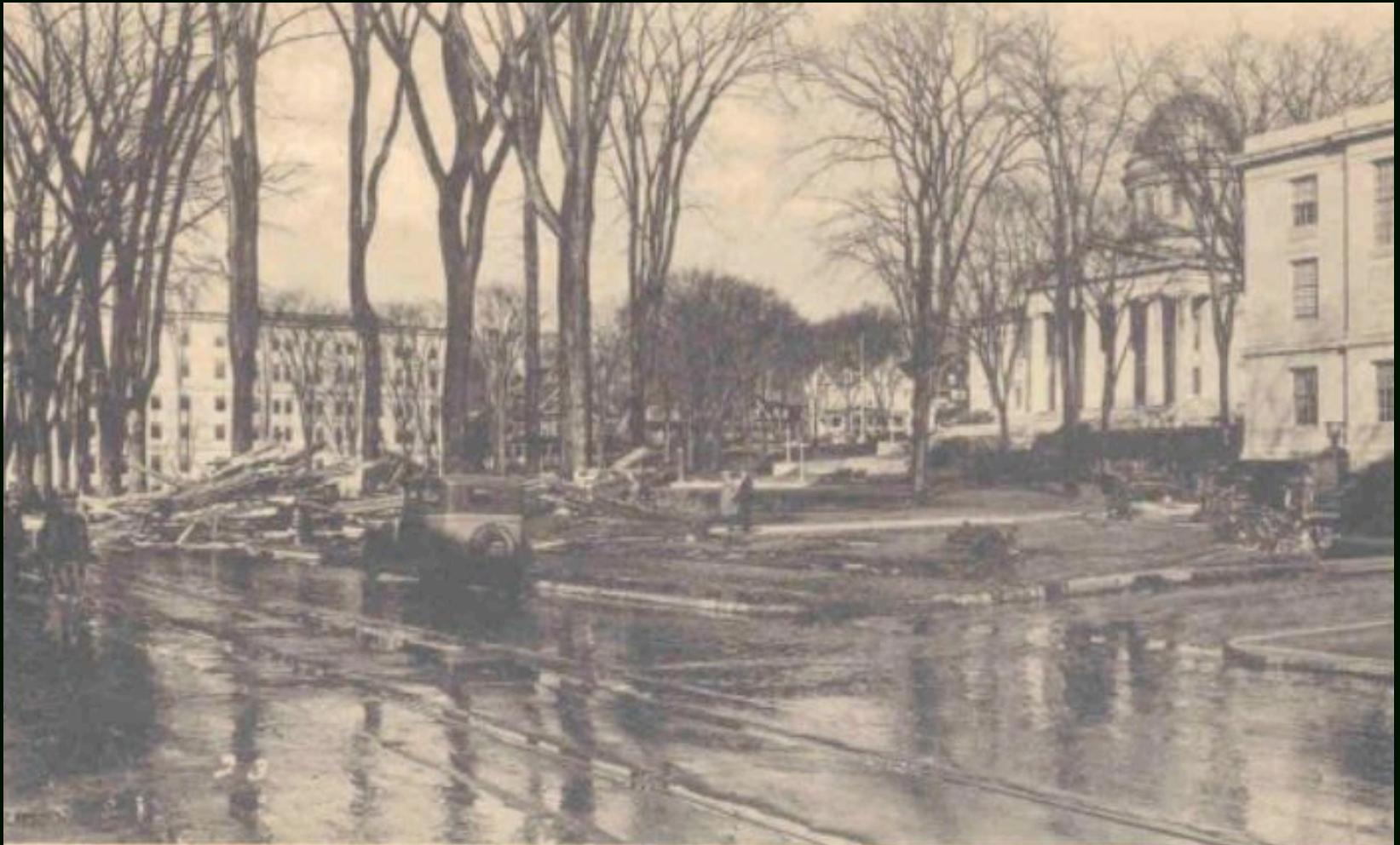
STATE STREET AFTER FLOOD ( 1927 ) LS01133_000

IN THE AFTERMATH, THE CITY WAS COST OVER 3,200,000 DOLLARS IN DAMAGES, BUT ONLY ONE LIFE WAS LOST.