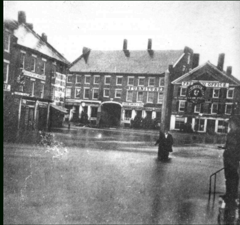
FLOODED DOWNTOWN ( 1869-10 EXACTLY ) LS03922_000