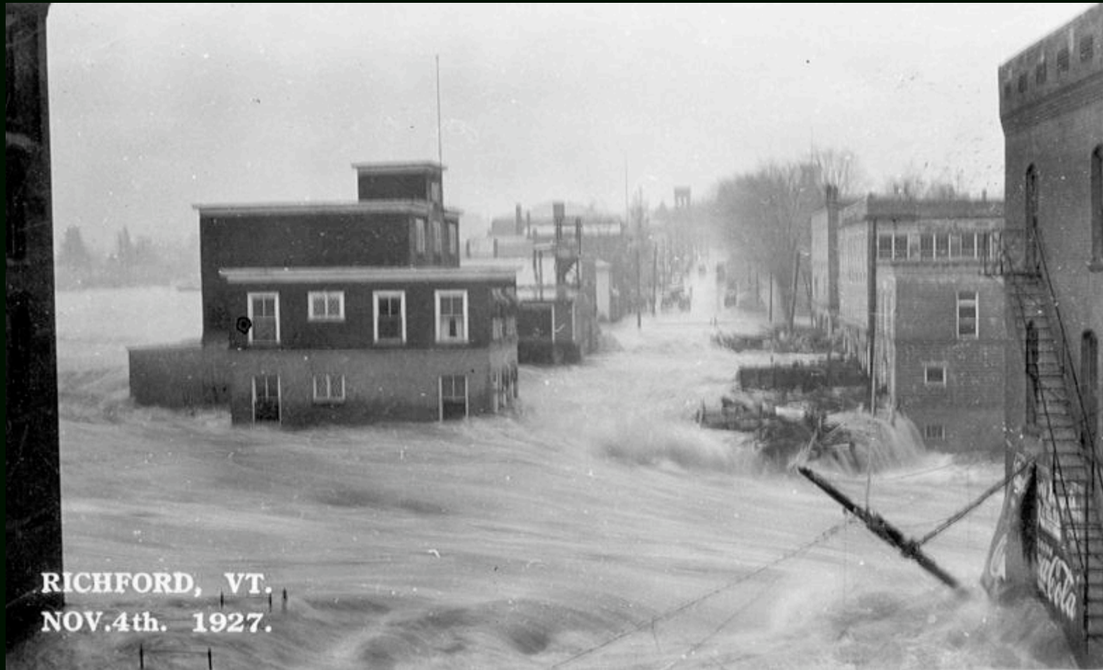
RICHFORD, VT. NOV.4th. 1927.

MAIN STREET DURING THE FLOOD OF 1927 (Nov. 4 ) LS00172_000