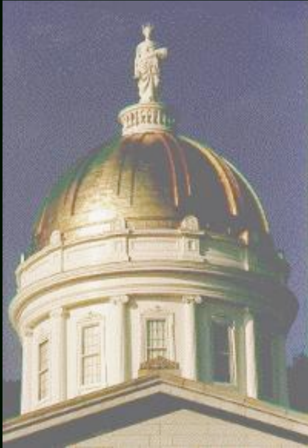
THE ORIGINAL STATEHOUSE DOME WAS SHEATHED IN COPPER AND PAINTED RED, NOT COVERED IN 24-CARAT GOLD-LEAF LIKE IT IS TODAY

ETHAN ALLEN'S BROTHER, IRA ALLEN WROTE OF VERMONT'S INHABITANTS: "THEY ARE ALL FARMERS..."