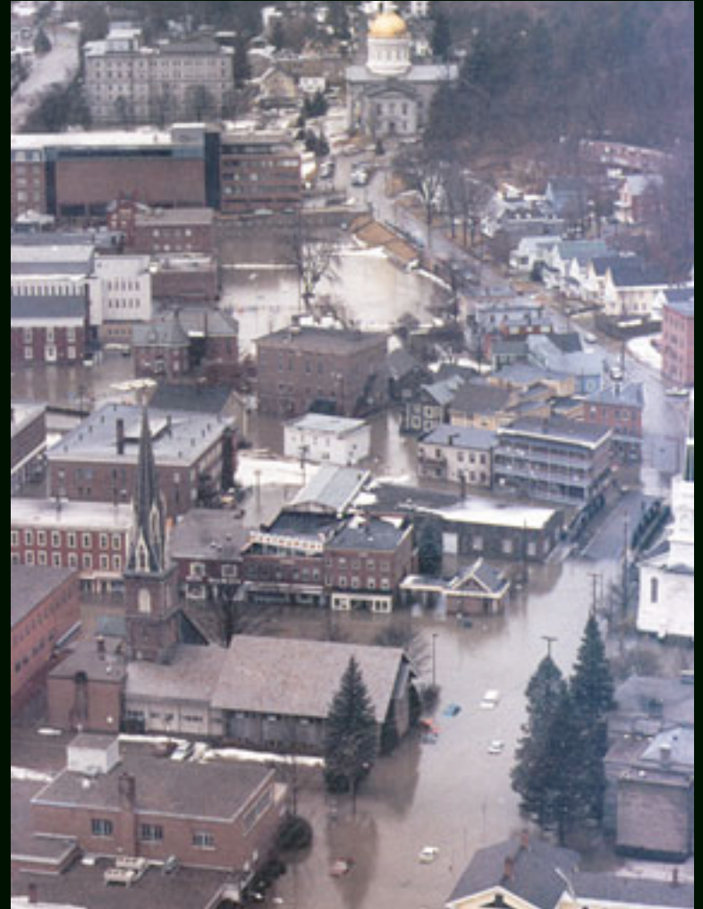
ARIAL VIEW OF 1992 FLOOD