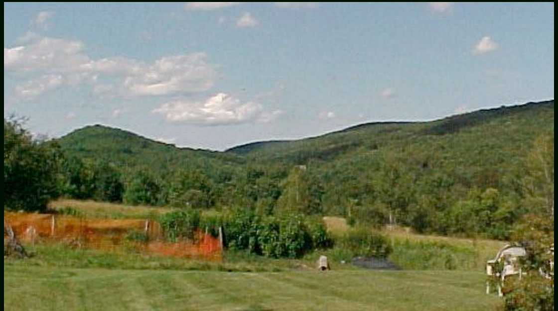
VIEW LOOKING INTO VILLAGE FROM SOUTHWEST ( 8/23/2000 ) LS00152_001