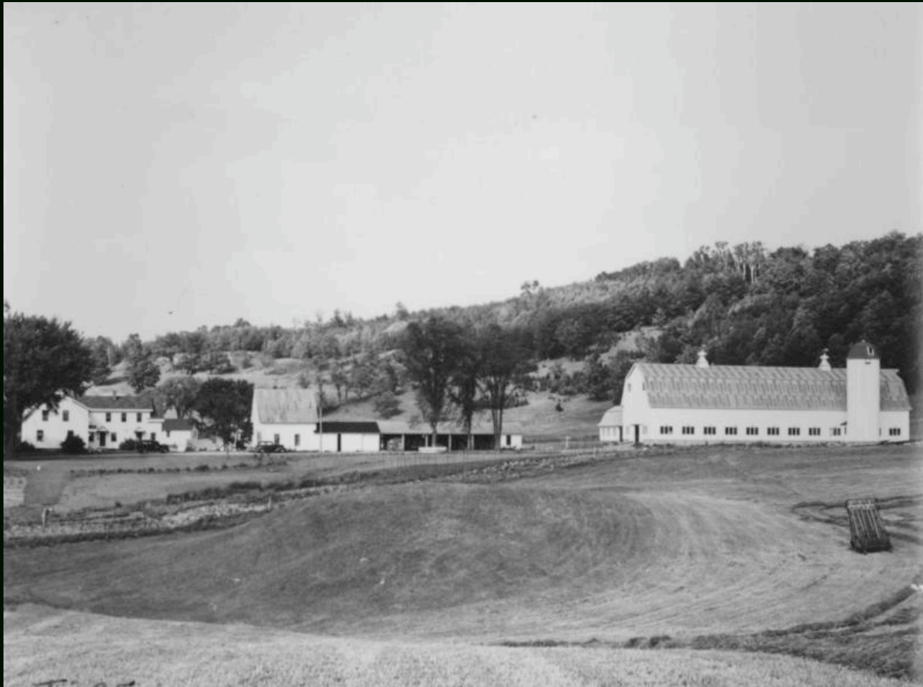
MONTPELIER FARM WITH OPEN FIELDS ( 1949 EXACTLY )