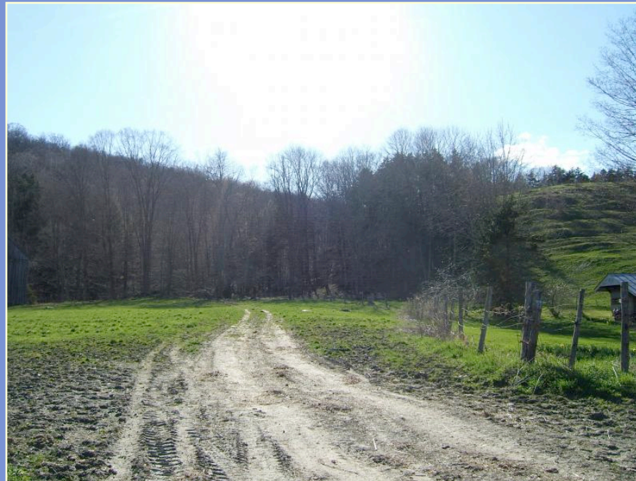
Town Unknown LS11685_001