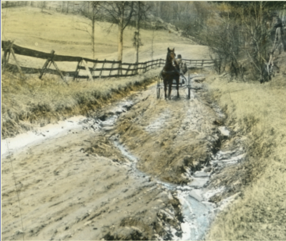
Town Unknown LS06477