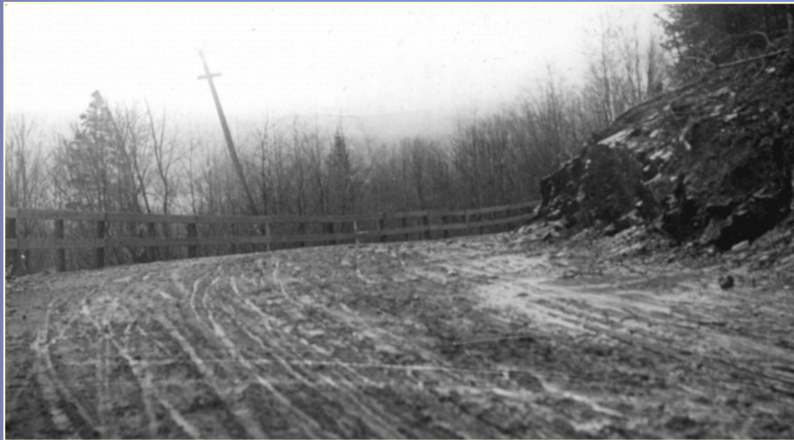
Town Unknown LS06505