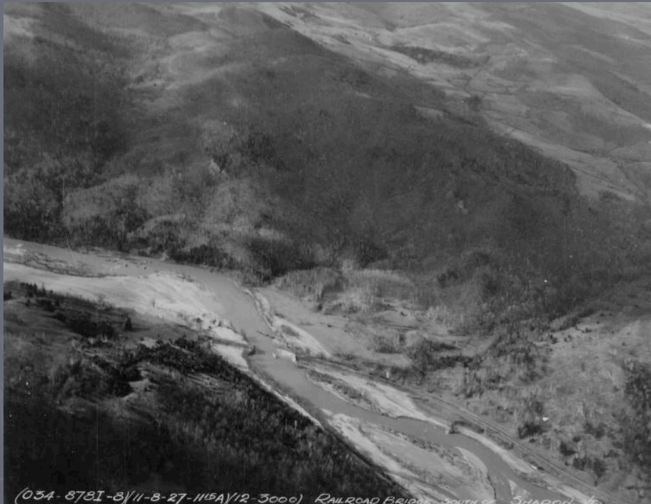
(05A-878I-8/11-8-27-1115A/12-3000) RAILROAD BRIDGE SOUTH OF SHARON, VT.

LS01450_000 (the washout of the railroad bridge in Sharon, 1927)