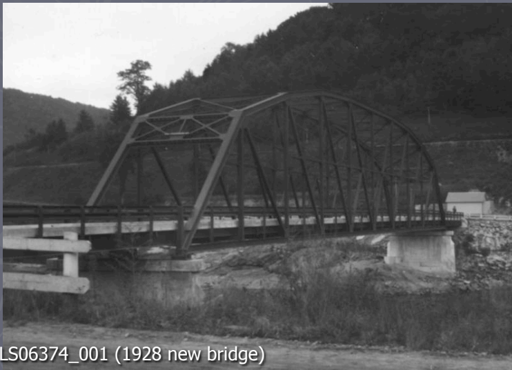
LS06374_001 (1928 new bridge)

Before the iron bridge was built in 1928, there was a wooden bridge that stood in the same spot. It was swept away during the flood. The new iron bridge was built higher and stronger than the old bridge.