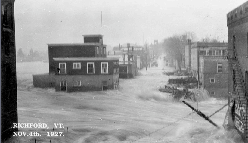
LS00172_000 (Main St during the flood, Richford, VT)