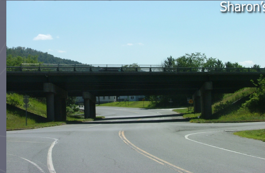
Highway bridge, center of town