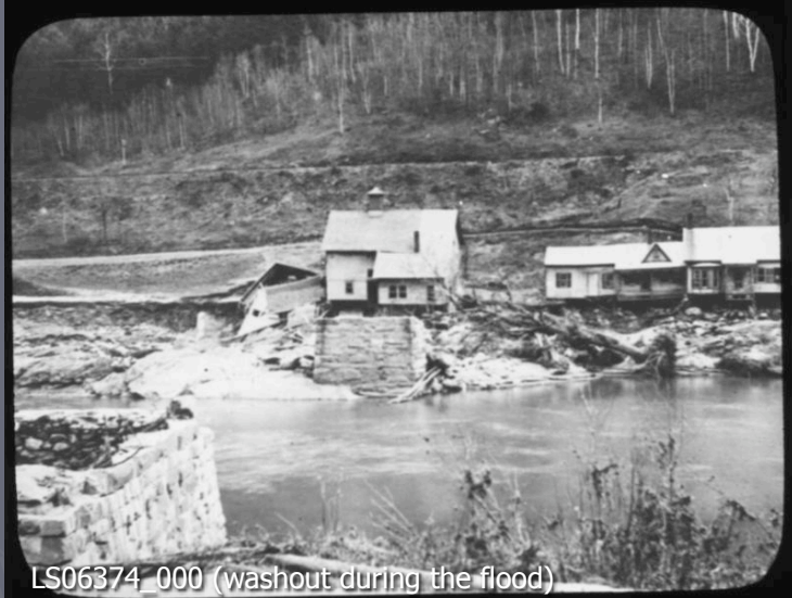
LS06374_000 (washout during the flood)