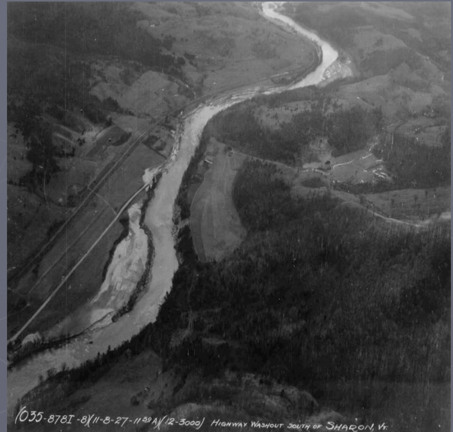
(035-8781-8)(11-8-27-11 29 A)(12-3000) HIGHWAY WASHOUT SOUTH OF SHARON, VT.

The picture shows where part of the highway washed out just a little south of Sharon. Steep banks are visible where the water washed away part of the road.