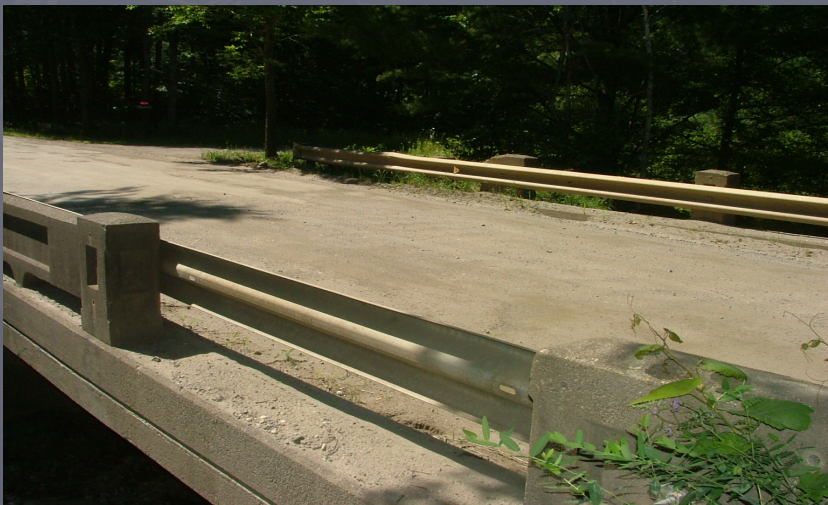
(A view of one of the rebuilt bridges on Broad Brook, 7/05)