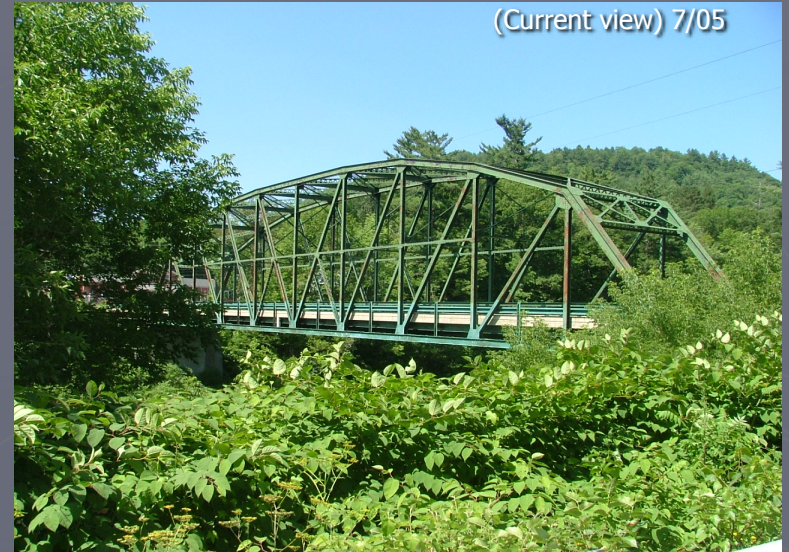
(Current view) 7/05