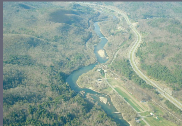
LS01448_001 (April 2000)