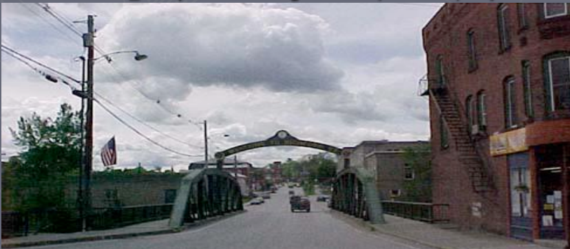
LS00172_001 (Present day Main St, Richford, VT)

October, 1927 rainfall for the state of Vermont was already 50% above normal.