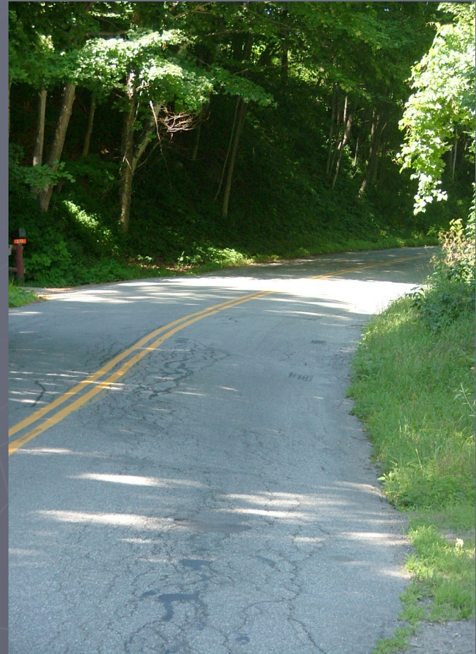
(Baldwin Hill leading into Strafford, 7/05)