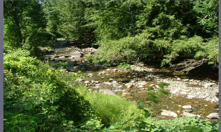
(A Shallow Chute of the Broad Brook in Sharon, 7/05)

Two bridges along the road were washed away due to the rising water of the Broad Brook in Sharon.