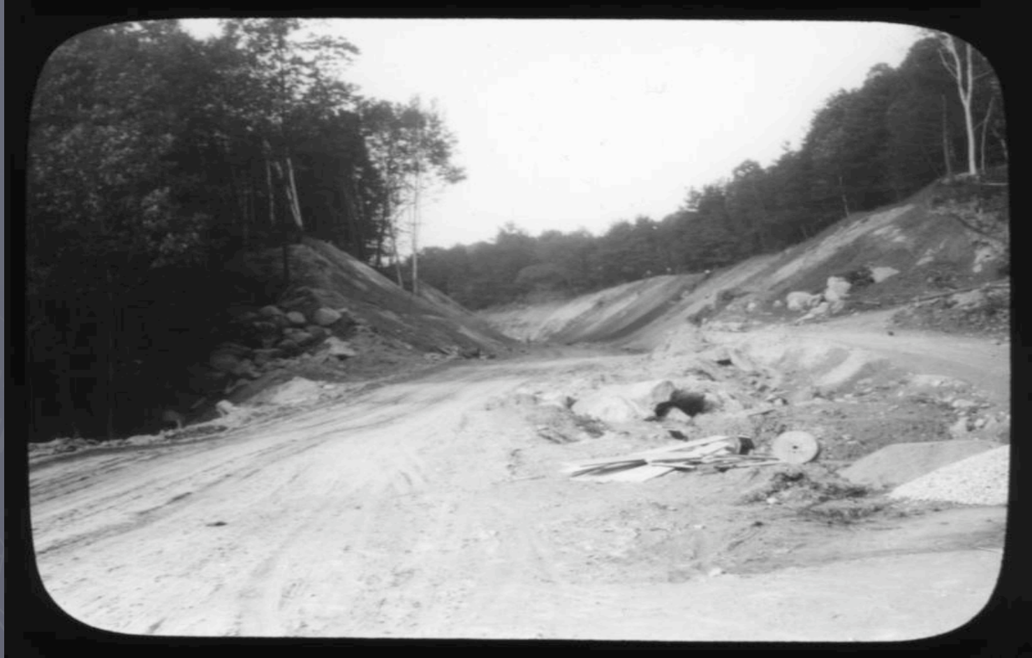
LS06607_000 (Construction work for a new road in Sharon)

Road Construction that was being done in Sharon for a cutoff road in 1928