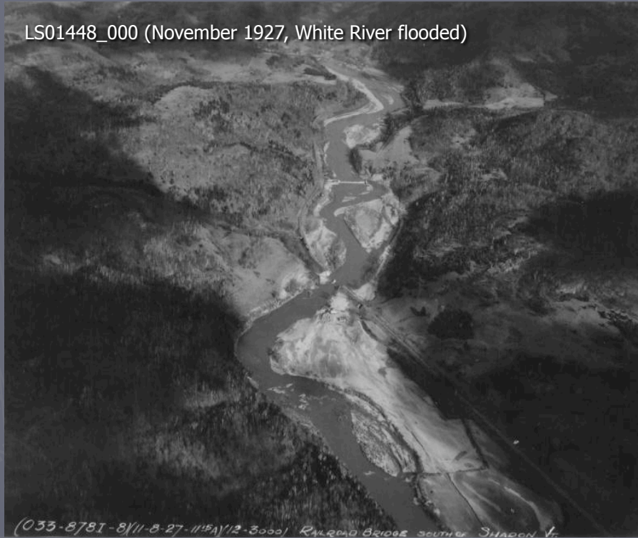
LS01448_000 (November 1927, White River flooded)