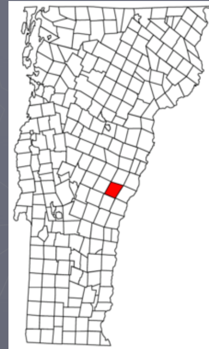
Sharon's location in the state