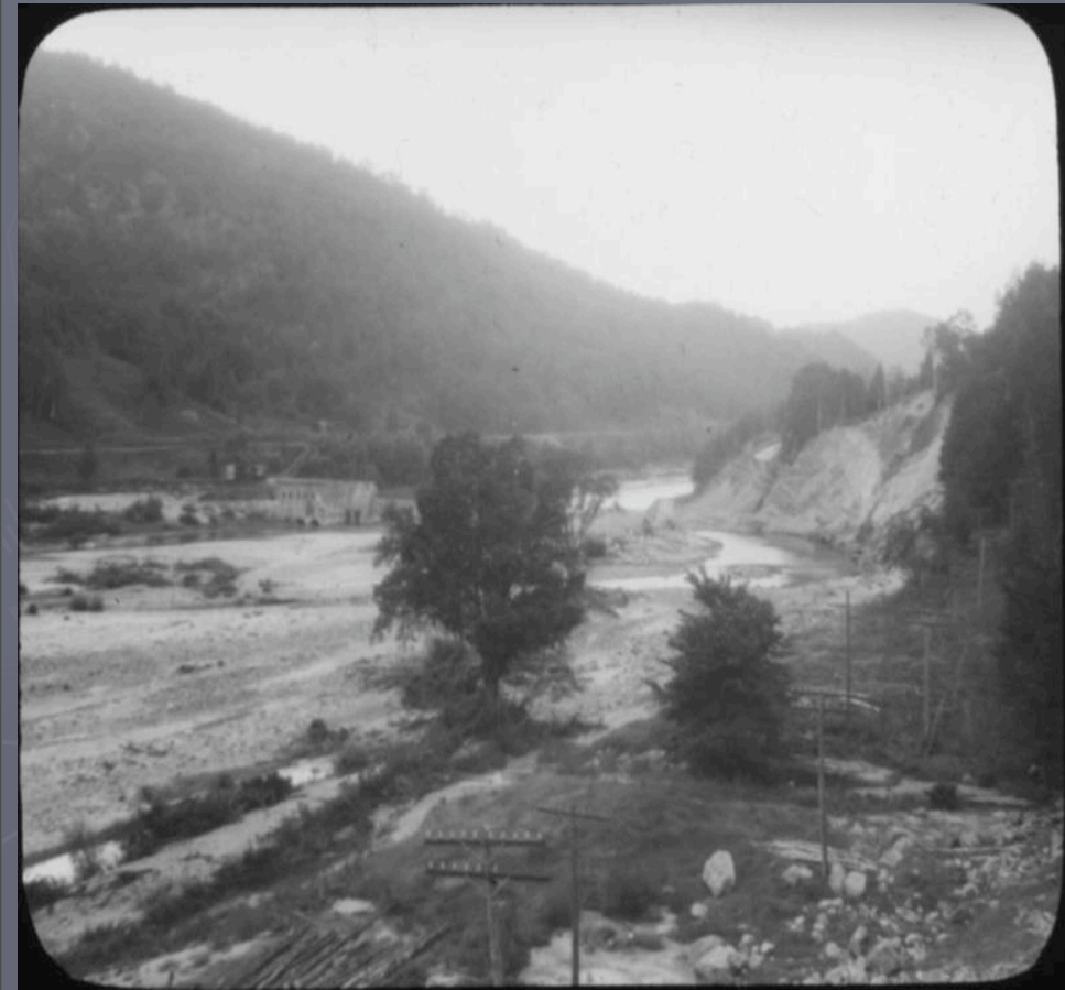
LS06606_000 (Flood damage to the highway just south of Sharon)

The picture shows part of the washout along the highway in Sharon.