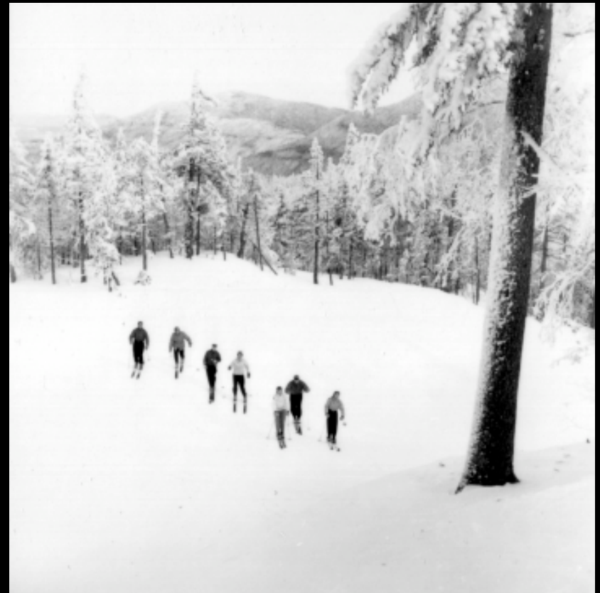
Skiers in a lesson at Spruce Peak