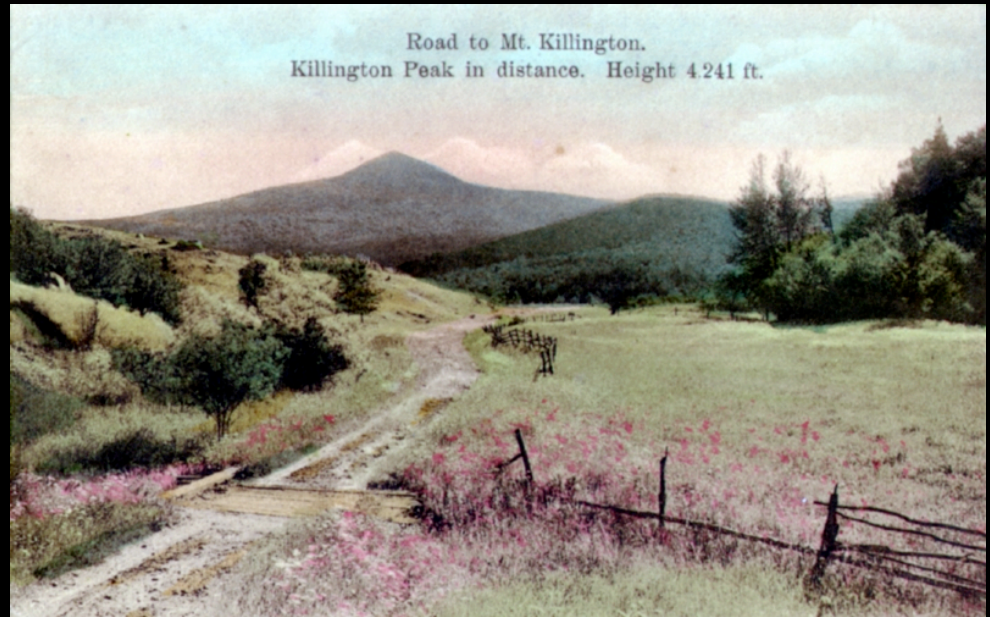
Dirt road leading to Mt. Killington