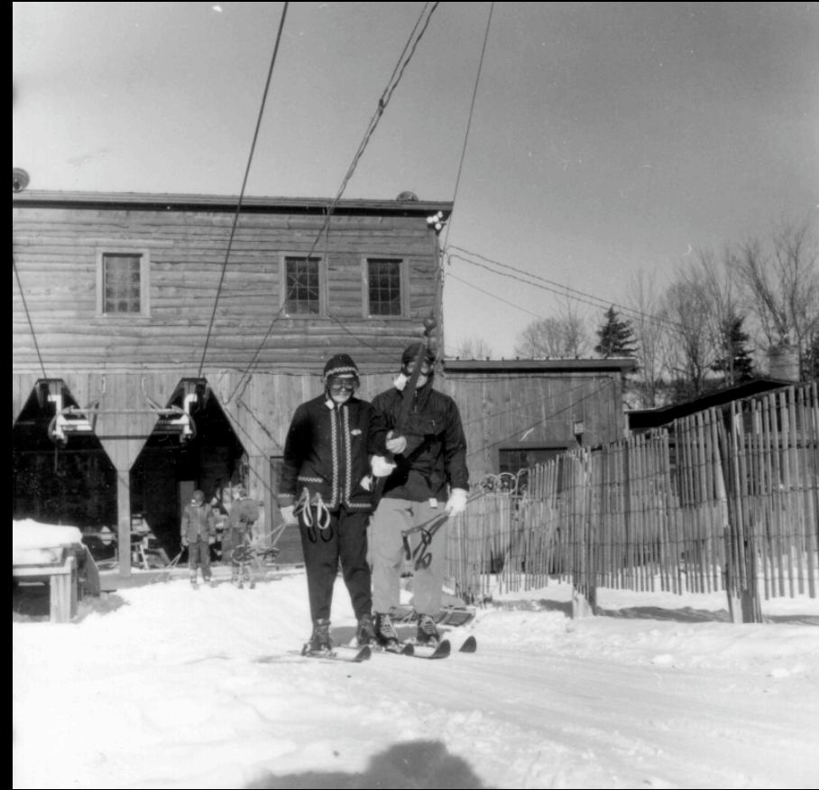
Skiers on a double rope tow