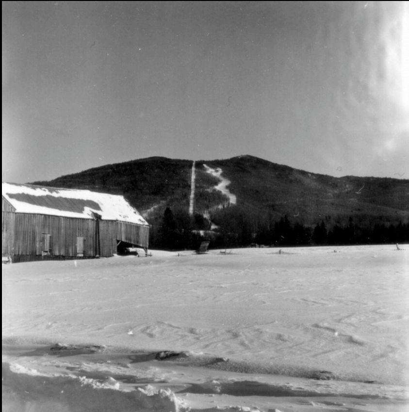
Burke Mountain on opening day

three mountains and the development of skiing