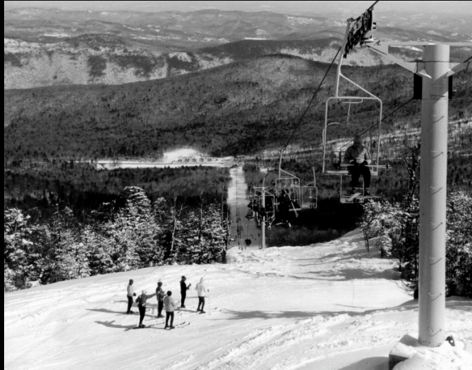
Skiers on the trail