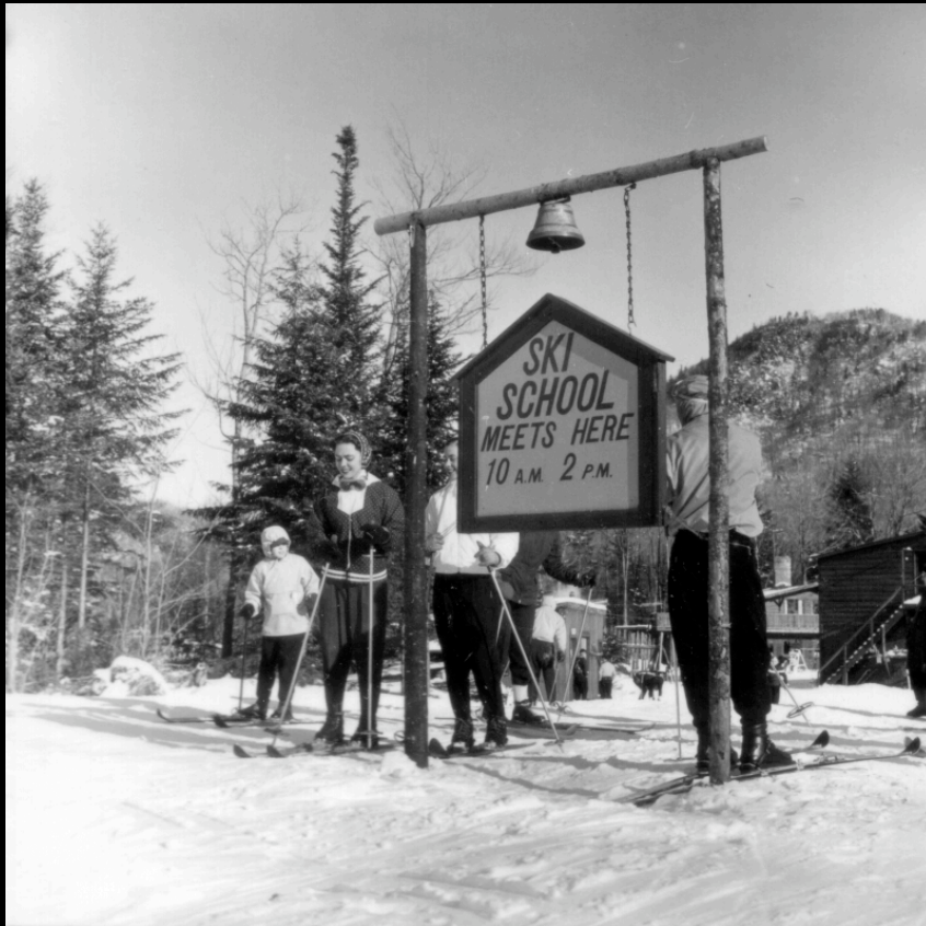
Eager skiers awaiting their lessons

three mountains and the development of skiing