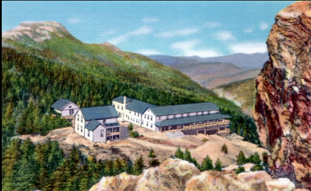
The Mansfield Hotel 1930-1945