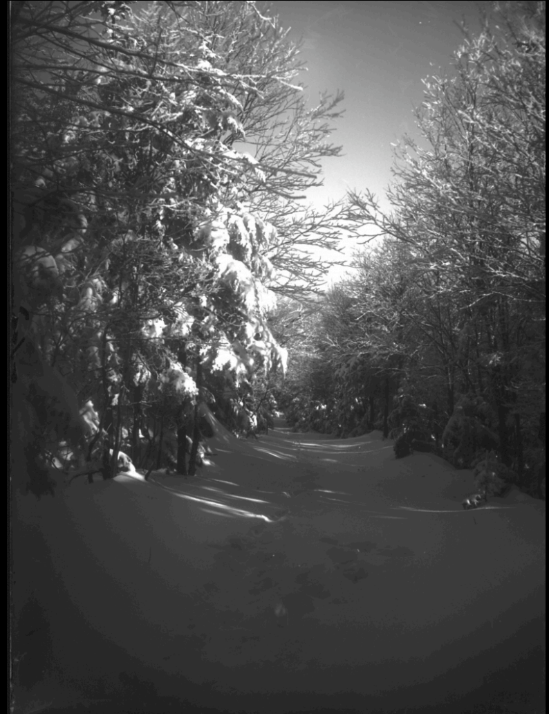
The snowy road to Stowe

This scrapbook will provide a glimpse into the history of alpine skiing in the state of Vermont. Skiing has had a tremendous impact on the lifestyles of Vermonters and the economy and landscape of this state. It will follow the development and transformation of three mountains: Burke, Stowe and Killington.