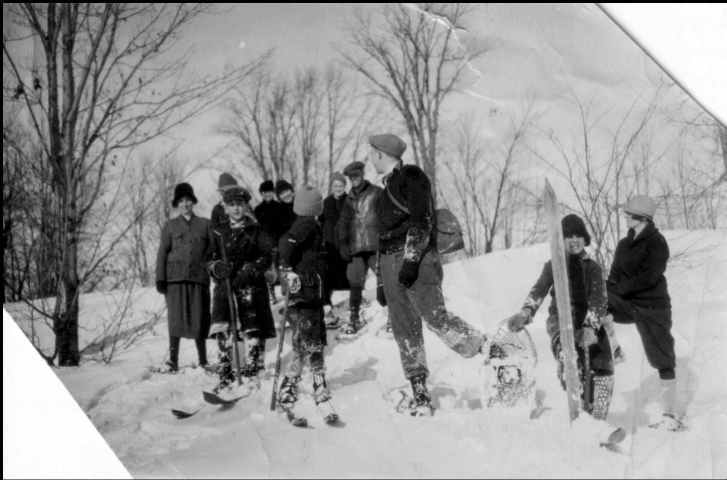
'School trip in the snow' Barre, Vermont 1920-1940 LS 05162