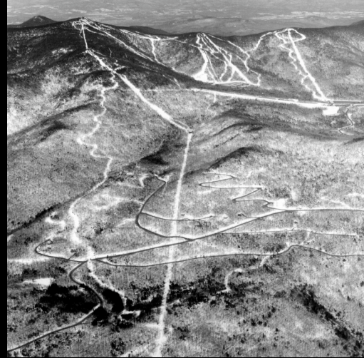
Above: Killington in 1967 (LS 07980)