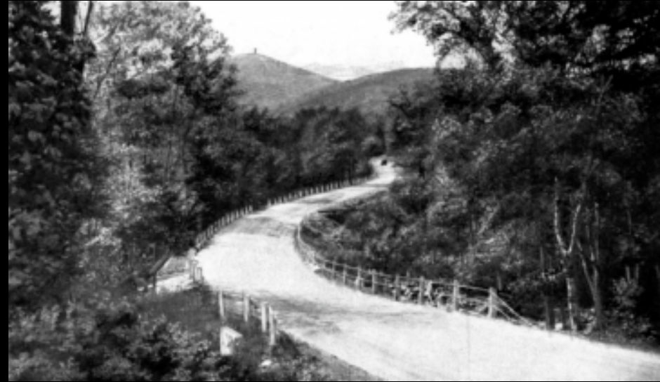
Road with view of the mountains