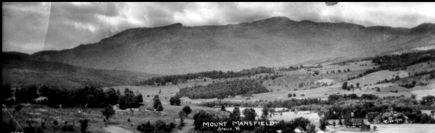
Mount Mansfield from the valley before ski trail