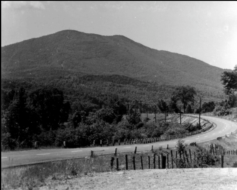
Burke Mountain and rural road Burke, Vermont 1930-1940