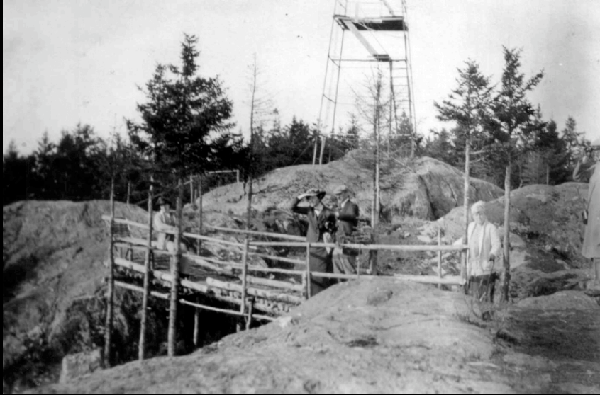
Fire tower on the top of Burke Mountain