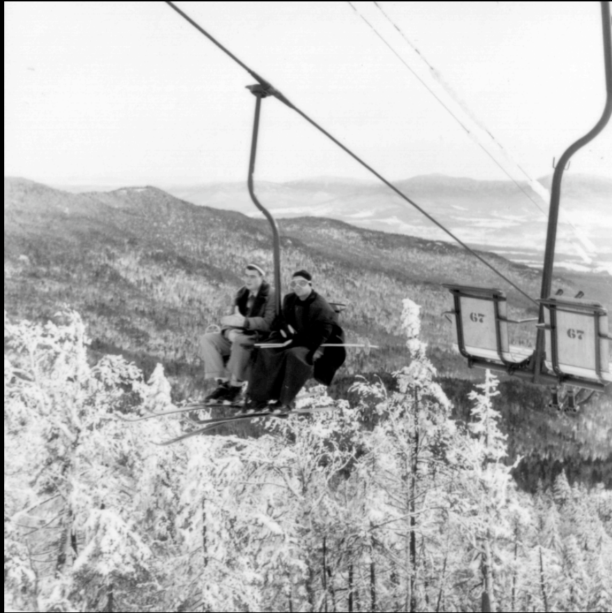
Skiers on a chair lift