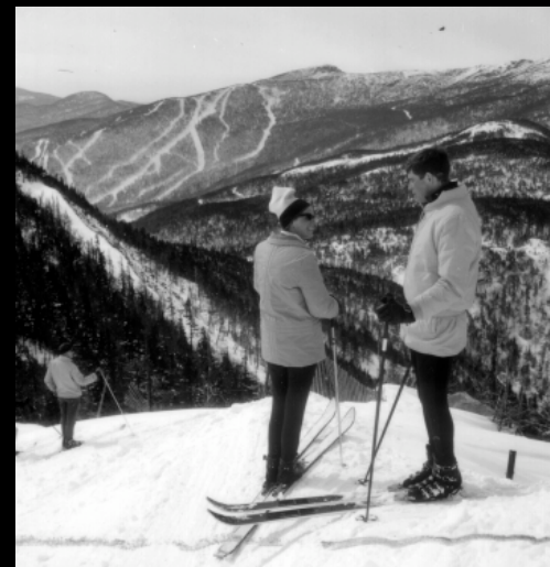
Below: Stowe in 1968 (LS 05714)

As ski areas and the ski industry continue to expand across Vermont, towns and citizens are called upon to make vital decisions that will effect the future of not only their lifestyles but also their economy, and their landscape.