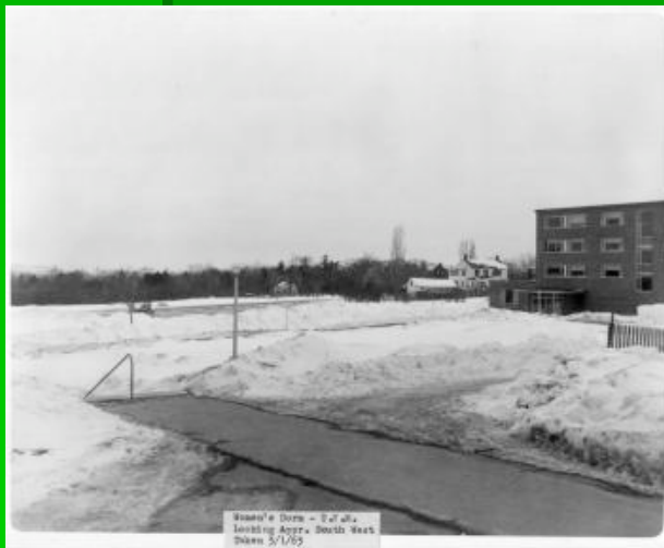
The land just before Christie Hall was built, taken in 1960