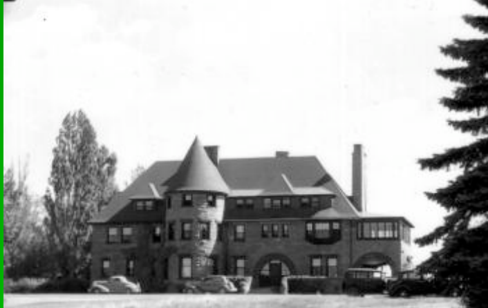
Redstone Hall, completed in 1889 (LS09784)