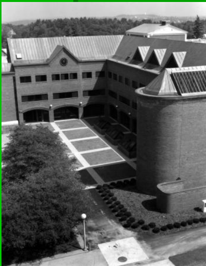
Kalkin Building, the Business School's home, was built in 1987.