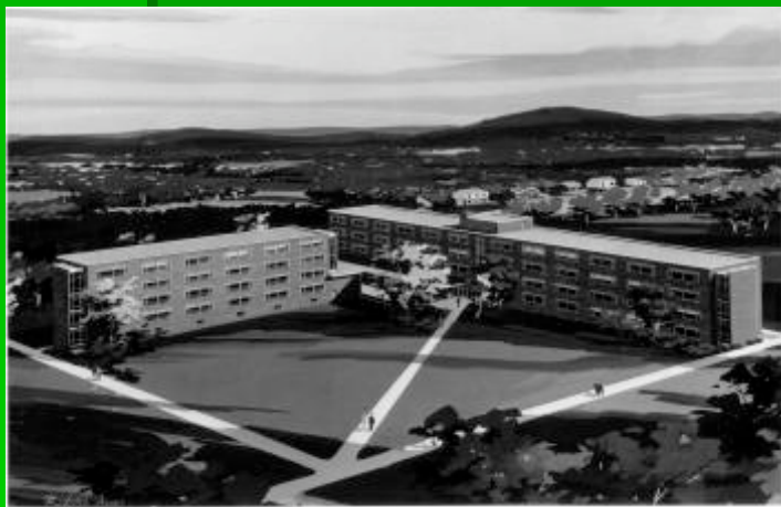
Marsh Austin Tupper, the first dormitory on Athletic Campus, was built in 1960 (LS10653)