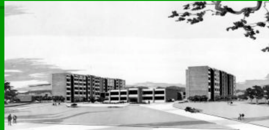
The Harris Millis complex was completed in 1967.