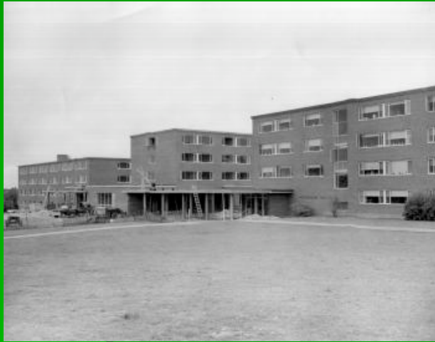
Christie Wright Patterson, built in 1962