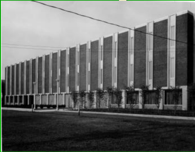
Votey Building is the Math and Engineering Department's home, completed in 1962.