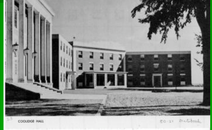
Coolidge Hall, built in 1947 (LS09931)