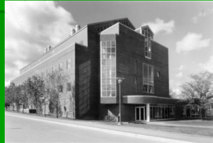
Stafford Hall was built in 1991 to house the Microbiology and Molecular Genetics Department.