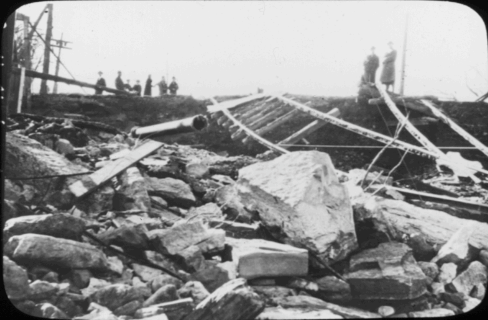
This lanternslide shows Burlington's side of a railroad bridge destroyed by the rushing waters. Huge rocks, a large pipe, mangled railway tracks, and wires are all thrown together into one tremendous mess. A crowd of people can be seen in the background observing the tangled debris.