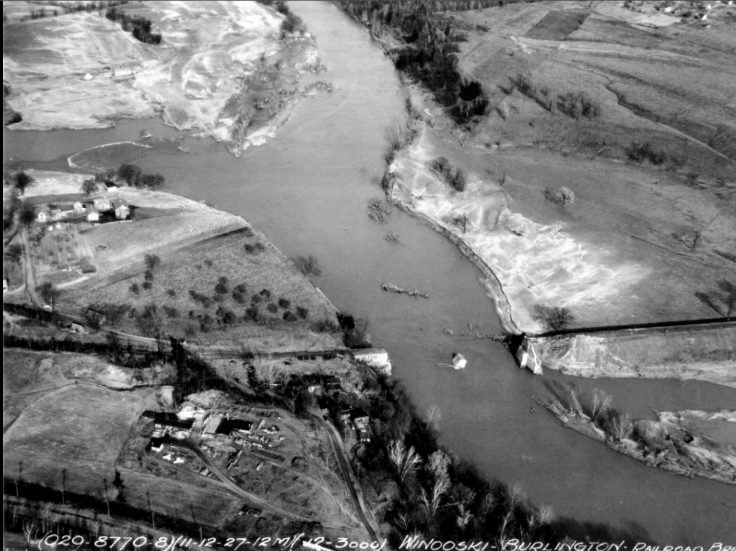
(029-8770-8) (11-12-27-12 M) (12-3000) WINOOSKI-BURLINGTON RAILROAD BRIDGE

Here is one more aerial shot of a bridge washed away by the flood of 1927. Over 1200 bridges were destroyed by the flood. This railroad bridge connected Winooski to Burlington, and the remains of a cement pylon can be dividing the river. Debris is strewn through out the river north of the bridge and the shoreline in Burlington and to the north has been visibly stripped and eroded by raging floodwater.